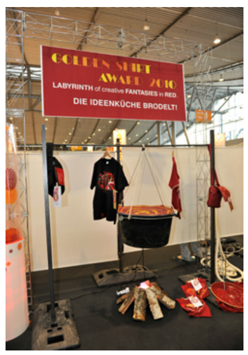
Golden Shirt Award Labyrinth